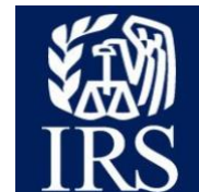
Nolan Fuller, Attaché IRS Criminal Investigations, US Embassy